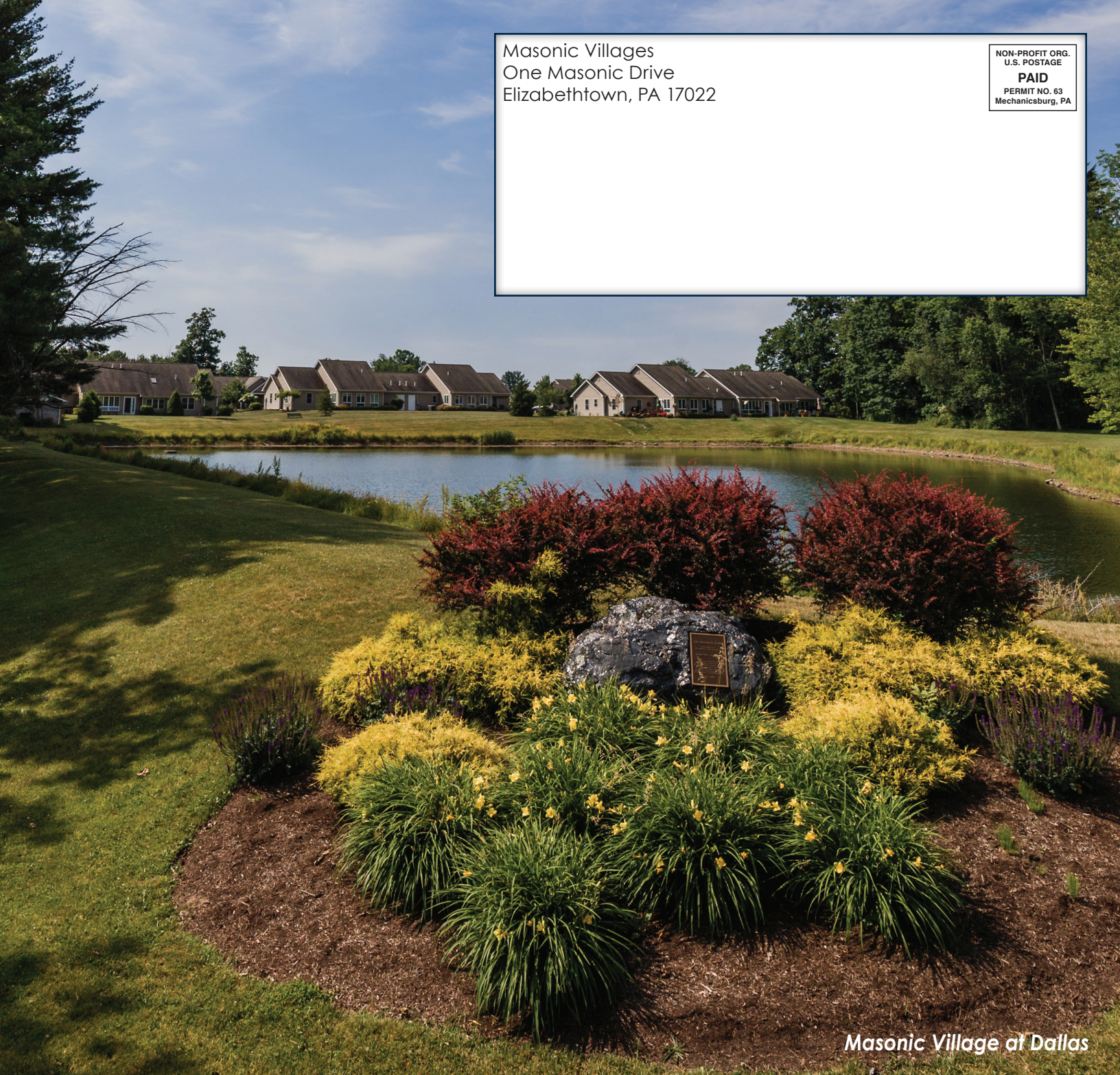
Masonic Village of Dallas

NON-PROFIT ORG. U.S. POSTAGE PAID PERMIT NO. 63 Mechanicsburg, PA