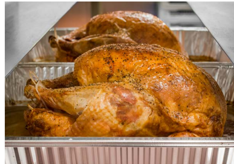
Order a delicious turkey this Thanksgiving from Masonic Village Catering!